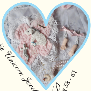
Zombie Unicorn Jewelry